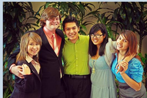
(Picture of E-Board 2011-2012)